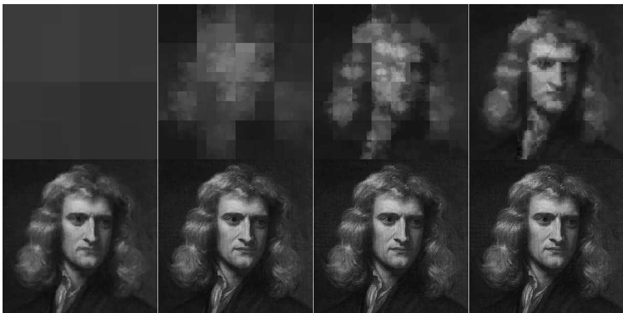
Fig. 1. Images compressed by FIC with rank blocks: 256, 128, 64, 32, 16, 8, 4 and original

As can be seen from Diagram 1 for PSNR metrics, even SSIM gray square is very similar to "Newton". The gray background, which occupies most of the original image, creates conditions for a high estimate of the similarity of PSNR and SSIM. PSNR steadily increases with decreasing block size (from 16.9 dB to 35.2 dB). The graph (gray line "normalized PSNR") shows an almost linear increase. This uniform increase does not reflect the real "jump" in quality that we see between blocks 32 and 16. PSNR equally "evaluates" the transition from illegible squares to a barely recognizable face. SSIM also increases with decreasing block size (from 0.46 to 0.93). Its curve (blue line) is slightly steeper than that of PSNR, which better reflects the improvement in quality in the last stages. Although SSIM is better